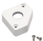
open end cap