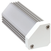
shown with closed end cap