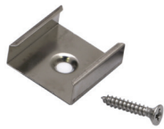
mounting clip & screw